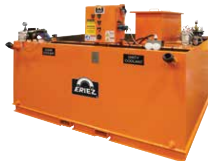
Coolant Recycling Systems Self-contained coolant and fluid management systems capable of recycling any water-miscible fluid to its maximum potential