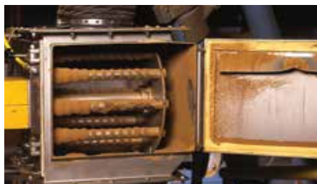
Magnetic Rota-Grate® removes metal contaminants from dry process flows. The slowly rotating tube circuit catches unwanted tramp iron and prevents bridging of powdery material like flour.