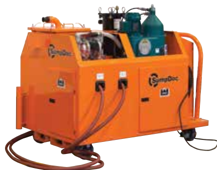
SumpDoc™ Inline Recycling and Filtration Two-phase cleaning operation to remove chips, oils, and fines, then replenish sump with clean fluid