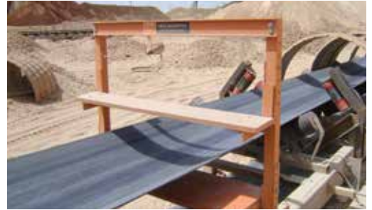
1200 Series Metal Detector detects large tramp metal for the aggregate and mining industries.