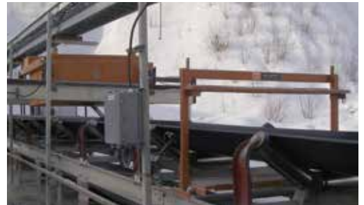
Double Team Tramp Metals combine powerful magnetic separators with sensitive metal detectors for the ultimate in protection from damaging tramp metals.