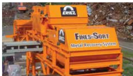
FinesSort® recovers small ferrous from waste at a scrap yard in Tennessee. Powerful Rare Earth Magnets recover virtually all ferrous metal from crushed automobiles and other scrap.