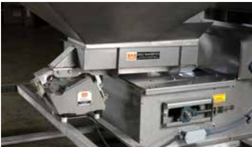
High Deflection Feeders are designed to feed difficult materials like powders as well as sticky and leafy products.