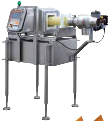
Xtreme Liquid Line Metal Detector for liquid slurries and pastes.