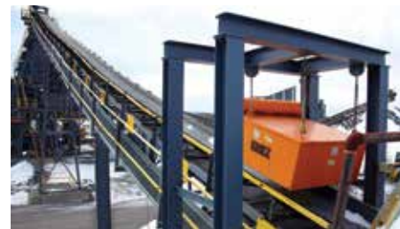
Suspended Electromagnets safely and automatically remove tramp iron from heavy product flows such as wood, coal or aggregate being conveyed on belts, vibratory feeders or in chutes.