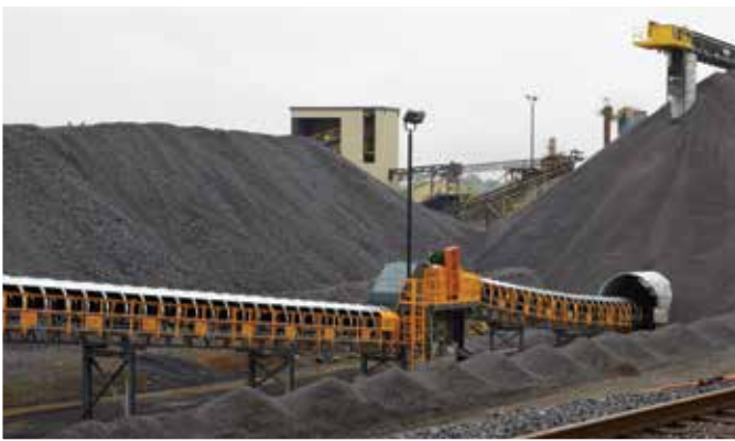
▼ Heavy duty mechanical feeders are found in high tonnage operations.

Eriez magnetic chip and parts conveyors are virtually maintenance free and are suited to move and elevate ferrous chips, turnings, small parts and stampings.