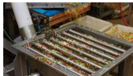
Grate Magnets used in food preparation at Better Baked Foods. Grate Magnets provide powerful, permanent protection against fine and tramp iron contamination.