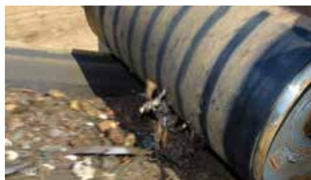
Magnetic Pulleys are used by auto shredders to separate ferrous metals on scavenger belt.