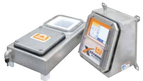
Xtreme Vertical Detectors ideal for detection and removal of ferrous, nonferrous and stainless steel metals in gravity-fed dry products such as plastic flake, grains, nuts, powders, etc.