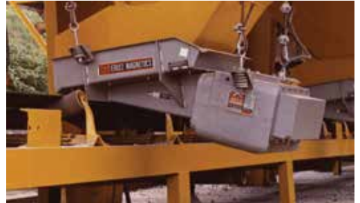
Large Vibratory Feeders meter stone to a belt conveyor from a hopper.