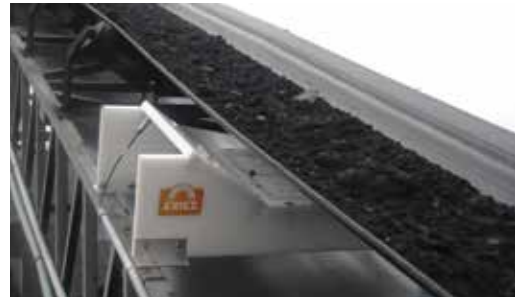
MetAlarm Model PL designed specifically for the plastic industry for the detection of all metals in shallow bed depths. Easily installs on light-duty conveyors.