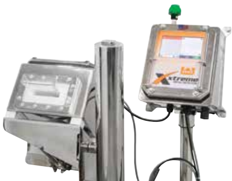
Pharmaceutical Metal Detector compact system for tablet press rooms that detects and removes sub-millimeter metal.