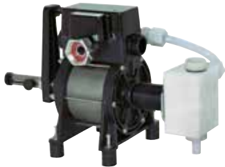
Concentration Controls Mixing and proportioning units to simplify coolant dispensing