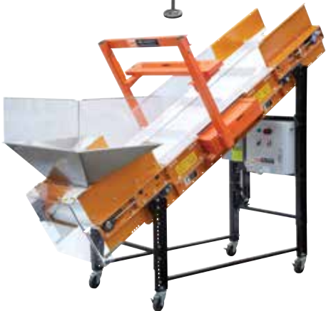
Metal Detector Conveyor convenient detector conveyor unit rolls into position to protect shredders, grinders and granulators.