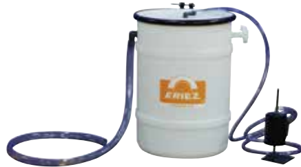
Tank Side Coalescer Allows tramp oils to naturally separate outside of turbulent sumps