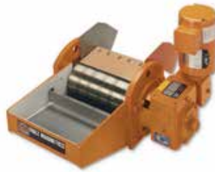
Magnetic Coolant Cleaner Media free magnetic removal of ferrous contaminants in metalworking fluid