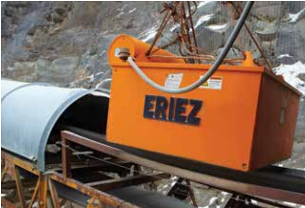
Many of Eriez products use magnetic technology.