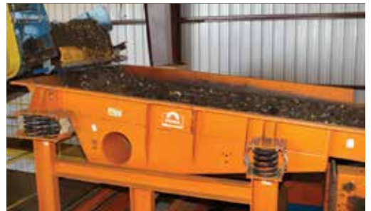
Mechanical Feeders present an even flow of material to an automated sorter at a scrap yard.