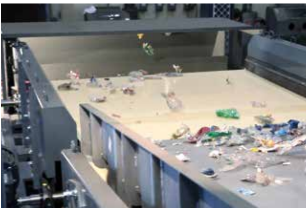
Eddy Current Separator sorts aluminum cans in a recycling facility.