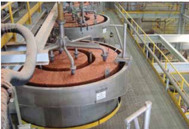
Eriez' 2007 purchase of Canadian Process Technologies (CPT) established Eriez Flotation as a market leader for both fine and coarse flotation.