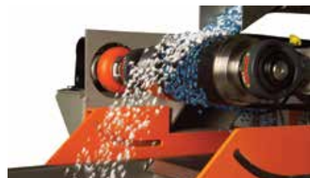
Magnetic Roll separates co-molded plastic regrind containing PolyMag™ metallic additive.