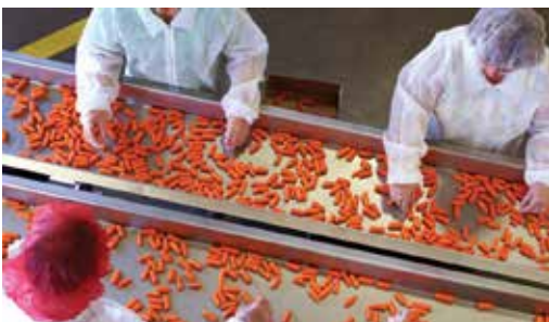
Inspection Conveyor workers visually inspect carrots on sanitary vibratory conveyors.