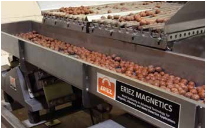
▲ A New York-based manufacturer of chocolates uses vibratory feeders and conveyors to process candies.

Eriez' vibratory products can be found moving tons of scrap steel in recycling yards, metering precise amounts of active ingredients in a pharmaceutical production line, conveying fragile potato chips in a packaging line or screening industrial materials in a glass factory. These applications would be served through either an electromagnetic or mechanical drive unit depending on your specific requirements.