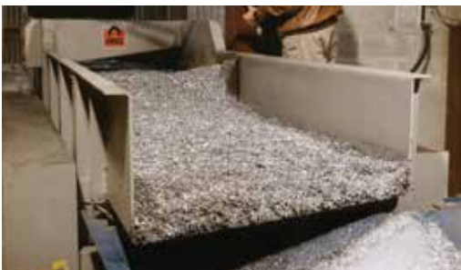
Mechanical Conveyors receive aluminum at a foundry in New York.