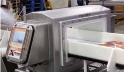
Xtreme Metal Detector our highest sensitivity system for food, pharmaceutical and rubber industry.

Eriez metal detectors are used in a variety of processing applications. Whether you're scanning for small ferrous, nonferrous or stainless steel contaminants or large tramp metal like digger teeth, Eriez offers the right metal detection solution.