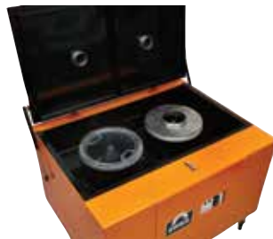
Rotor Bowl Centrifuge Rotor bowl centrifuge removes sludge in grinding, honing and finishing operations