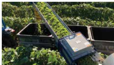
Plate Magnets produce a powerful, deep magnet field to attract and hold ferrous contaminants within heavy material flows. Eriez offers the widest range of models for virtually any product free-flowing application.