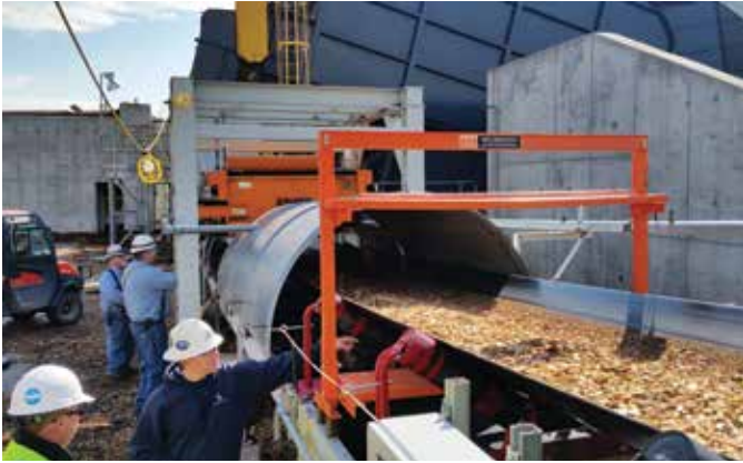
▲ A 1200 Series metal detector and a suspended magnet protect downstream equipment from tramp metals.