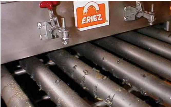
▲ Grain mill uses Xtreme Rare Earth grate magnets to remove metal contaminants.