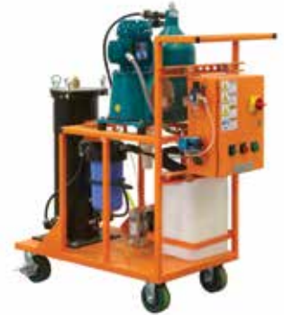
Portable Centrifuge Removes free and emulsified tramp oils through a high speed centrifuge