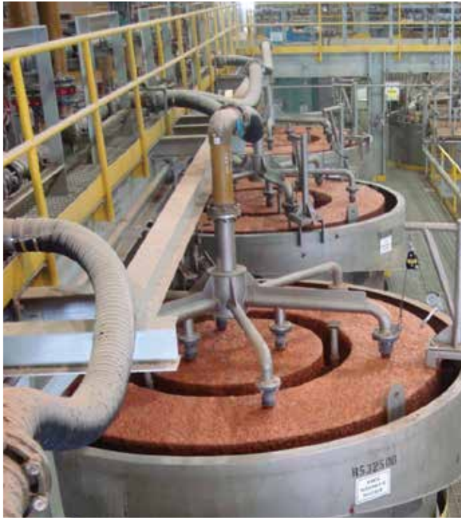
▲ Column flotation cells recover fines material in processing operations.