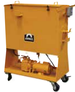
Portable Coalescer High volume removal of free oils and fine particulates