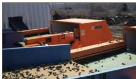
Eddy Current Separators utilize Rare Earth magnets arranged into high speed, composite-shelled rotor to deliver exceptional nonferrous metal separation from PET flake and bottles.