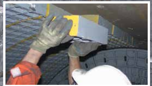
▲ A magnet holds the liner to the drum.