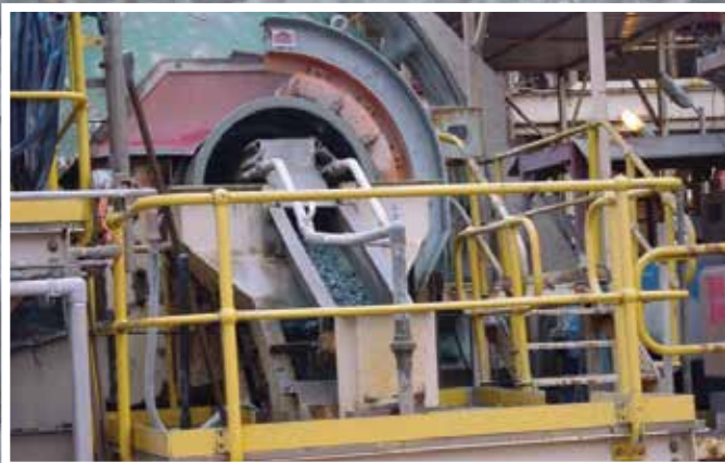
▼ Trunnion Magnet removes broken ball fragments on a Ball Mill in Chile.

Eriez offers a variety of solutions for the beneficiation of industrial minerals to produce high purity products. Various types of low, medium and high intensity magnetic separators are used in batch or continuously, and in either wet (slurry-based) or dry processing applications. Eriez Flotation's flotation cells, spargers, slurry distributors and test equipment are used in roughing, cleaning and scavenging applications in metallic and non-metallic processing applications.