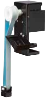
Belt Skimmers Removes surface oils from machine tool sumps

Applications include: Machining • Conventional Grinding • Creep Feed Grinding Super Abrasive Machining • Water Jet Cutting • Parts Washers