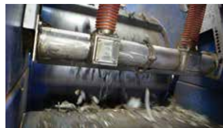
CleanStream Process recovers 99% of the ferrous and concentrates it to less than .2% copper in auto shredding facilities.