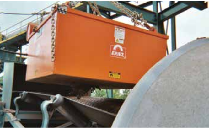
▼ Suspended electromagnet removes tramp metal at an aggregate plant.

Eriez' origins can be traced back to a single plate magnet installed to remove tramp metals from the flow of grain, thus removing the danger of sparks in the highly flammable environment.