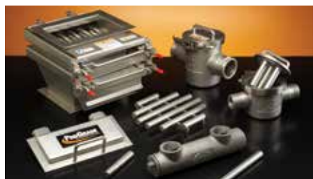
Small Magnetic Separators effectively remove tramp iron in both liquid and dry processing applications.

Magnetic equipment is commonly used to remove dangerous unwanted metal contaminants from product flows. This equipment is also widely used in resource recovery applications to sort and reclaim valuable metals.