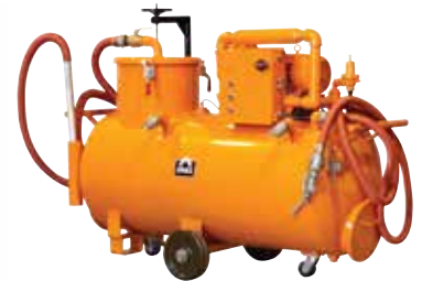
Sump Cleaner Vacuums chips from the sump and filters coolant for fast and easy sump cleaning