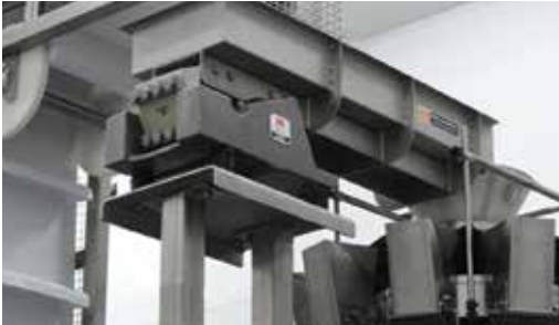
Sanitary Vibratory Feeders present products to weigh scales in packaging applications.

In addition to standard units that are available for quick shipment, Eriez offers a broad range of customized feeders, conveyors and screeners specifically designed for your unique application.