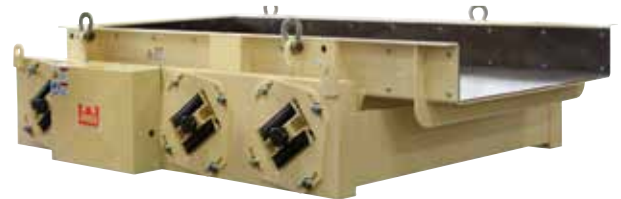
Heavy Duty Mechanical Feeders are ideal for high capacity applications in harsh environments.