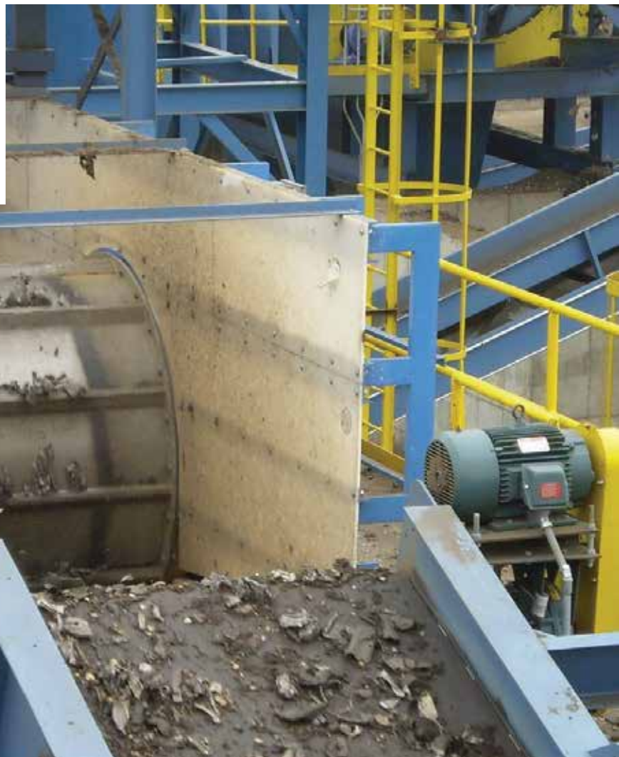
▼ Scrap drum magnets separate ferrous metals at an auto shredder.

Through continuous innovation, the company now offers a wide range of separation technologies designed to remove, sort, classify or concentrate materials, thereby improving product quality and often its safety. These solutions range from removing micron-sized, weakly magnetic contaminants in food to concentrating tons of iron ore in mines.