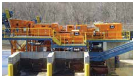
Sorters recover nonferrous metal at a scrap yard in Mexico.