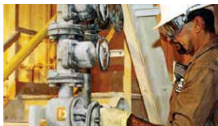
Magnetic Traps remove metal contaminants from titanium dioxide production at a chemical plant in Ohio. Traps are available in a wide selection of sizes and configurations.